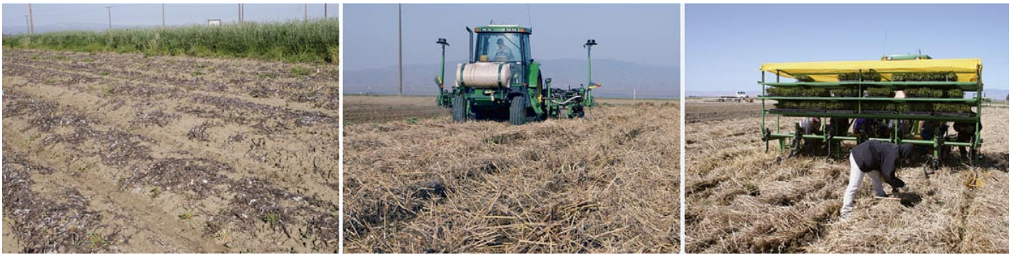
Cover crops in conjunction with conservation tillage helped to maintain soil fertility. Left , cotton and tomato crop residues prior to no-till transplanting; center and right , no-till cotton planting with a John Deere 1730 no-till transplanter directly into a cover crop of triticale-winter rye-vetch.

nitrogen were more variable. The CTCC and STNO treatments had much higher total soil nitrogen values than expected; STCC had a slightly larger value, while CTNO had a much larger loss than expected. Nitrogen is generally much harder to budget than carbon. The differences between the budgeted and actual values for the two cover-crop treatments suggest that the actual nitrogen fixation rate of the cover crop was larger than we estimated. The largest difference between expected and actual total soil nitrogen was in the STNO treatment, where we expected a total nitrogen loss and instead we saw an increase of 535 pounds nitrogen per acre. This difference is difficult to explain. The nitrogen budget does not account for nitrogen losses due to leaching or denitrification; these two processes may account